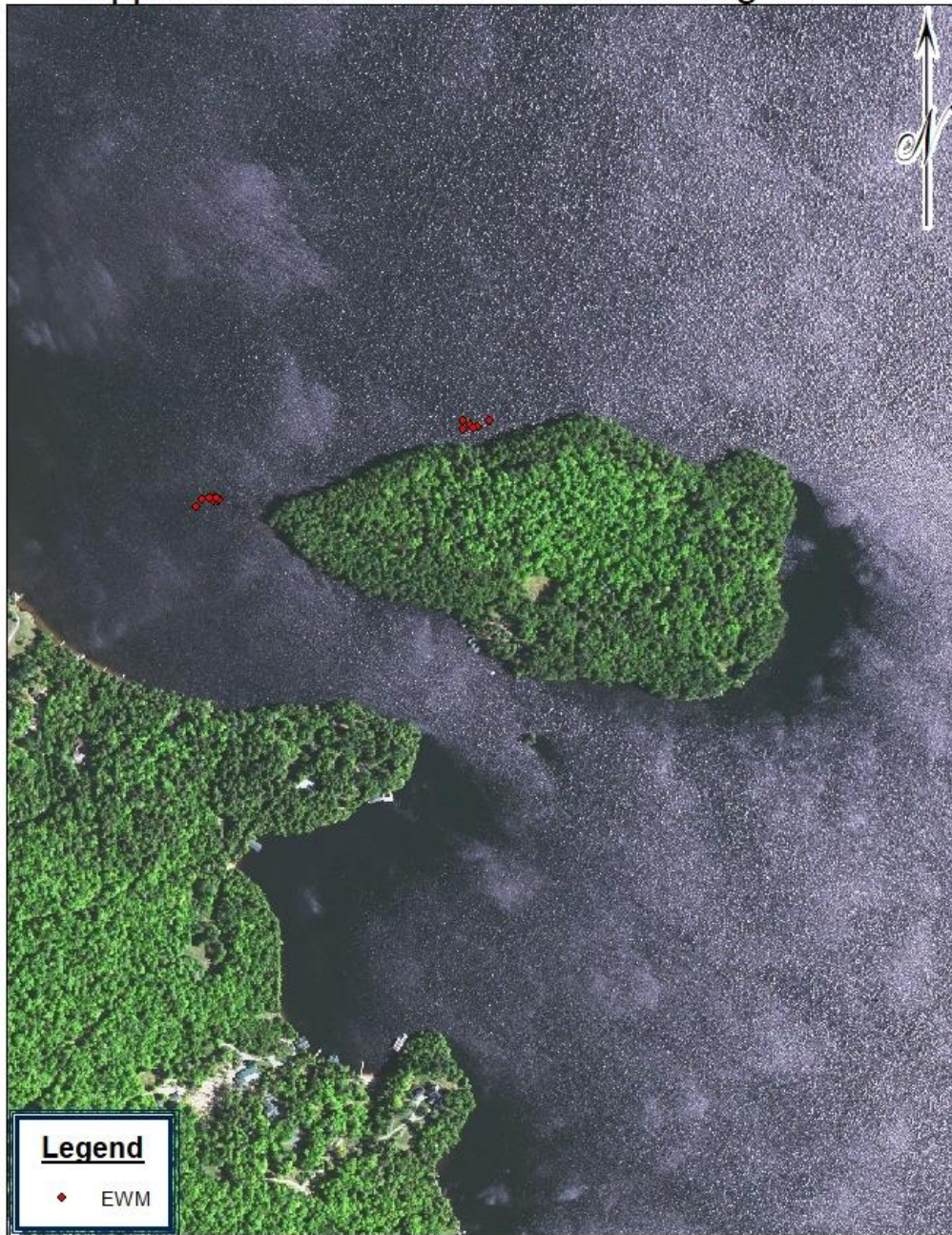
Site 30- Deer Island