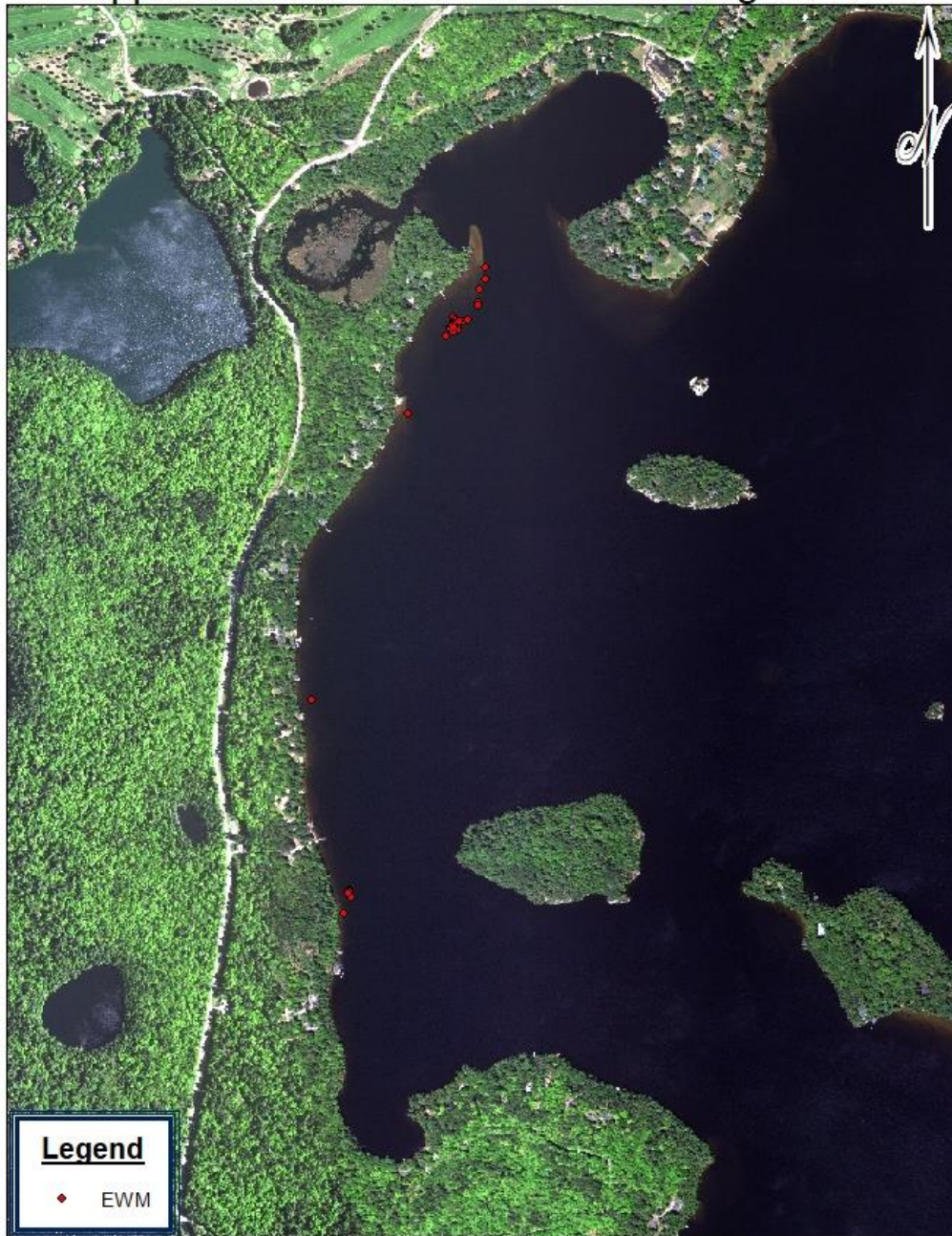
Site 3- College Row Site 8- Green Bay- Moss Rock Point