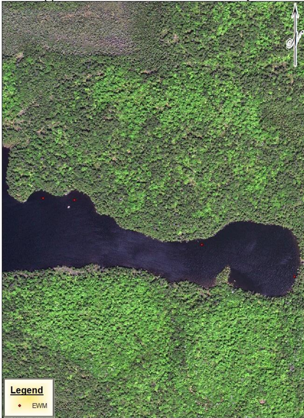
Site 15- Saginaw Bay