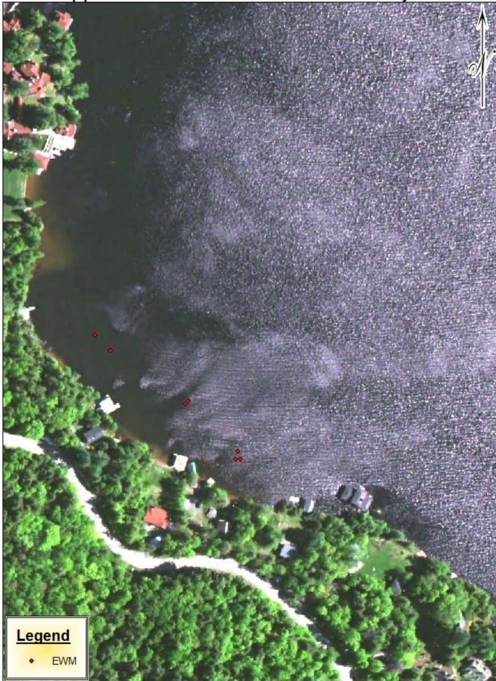
Site 35- Wenonah